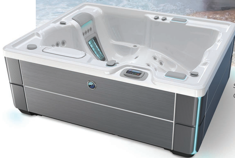
Shown with Alpine White Shell and Charcoal Cabinet