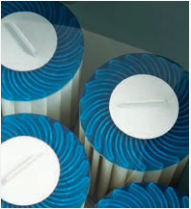
100% Filtration SilentFlo Circulation