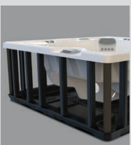
Polymer Substructure & Base Pan