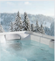
Super Energy Efficient