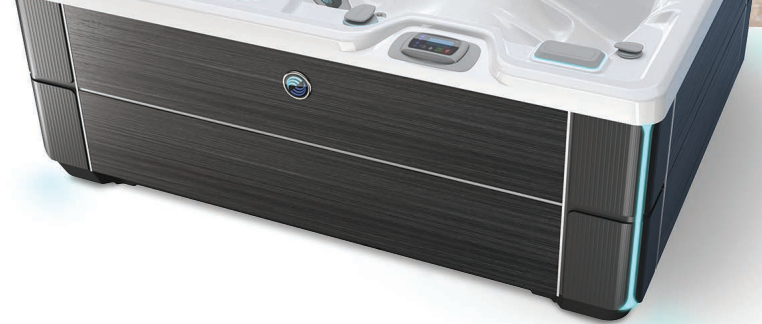
Shown with Alpine White Shell and Blackwood Cabinet