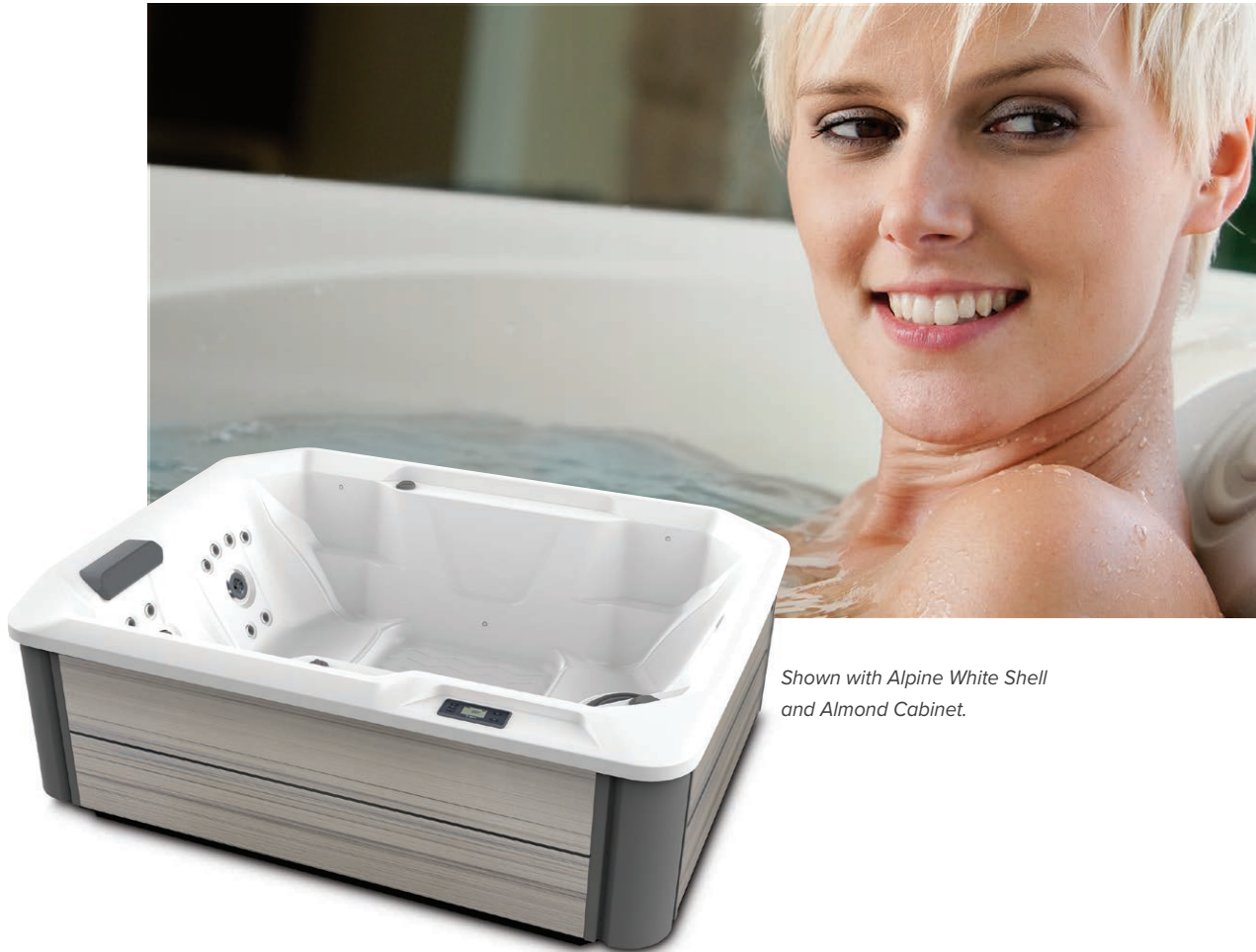
Shown with Alpine White Shell and Almond Cabinet.