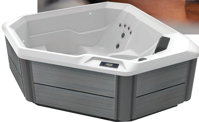
Shown with Alpine White Shell and Storm Cabinet.