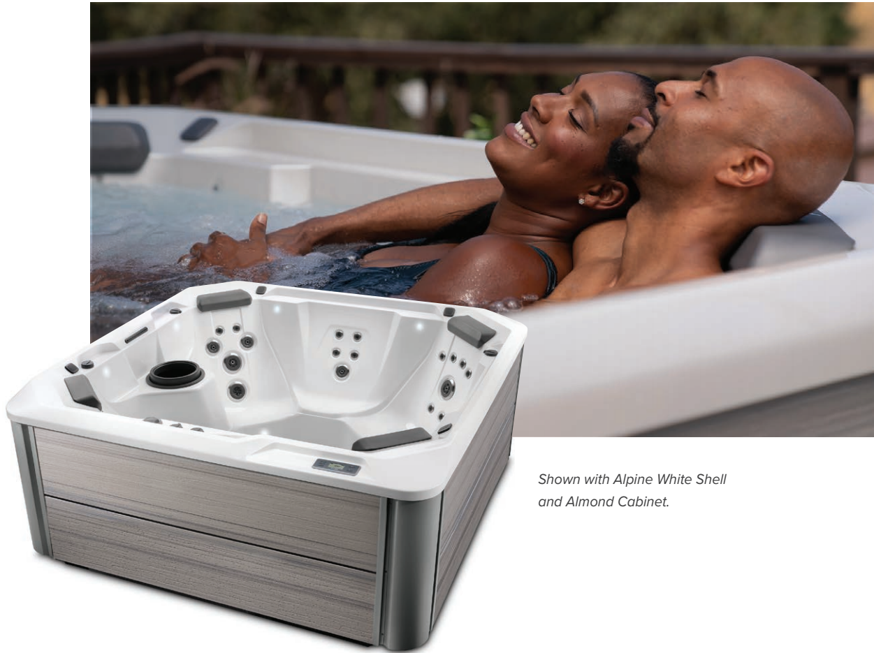
Shown with Alpine White Shell and Almond Cabinet.