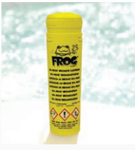
FROG® In-Line Sanitising System