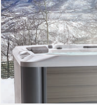
FiberCor® High-Density Insulation